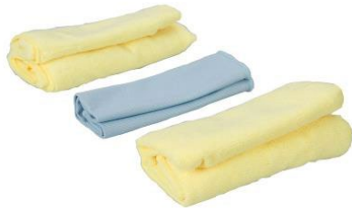
Degreasing with rag