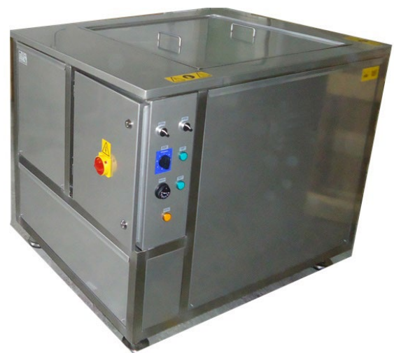
Ultrasound tanks from 10 % in water