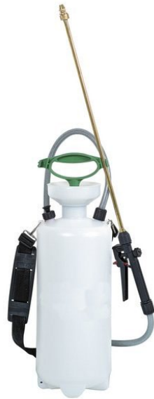
Low-pressure sprayers with water rinse from 20% in water