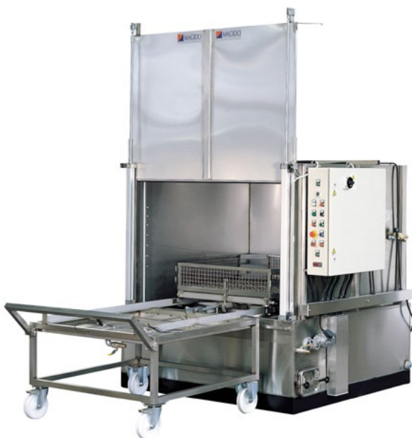
Spray washing machine from 10 % in water