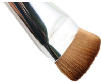
Degreasing with brush